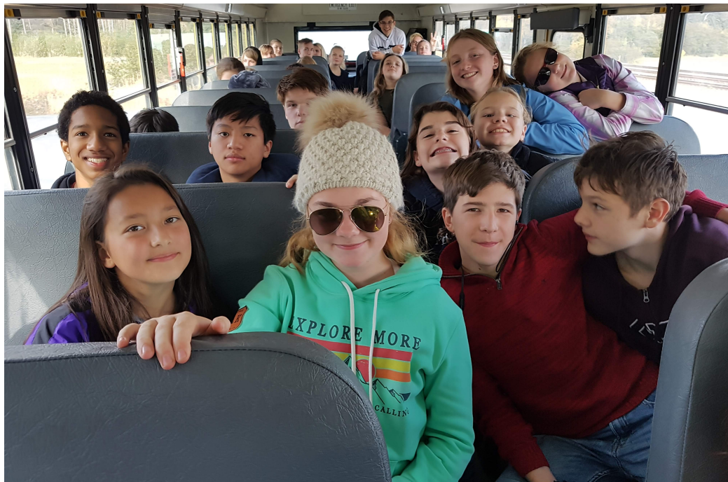
Russian Exchange Student Trip to Seward - Sept., 2019