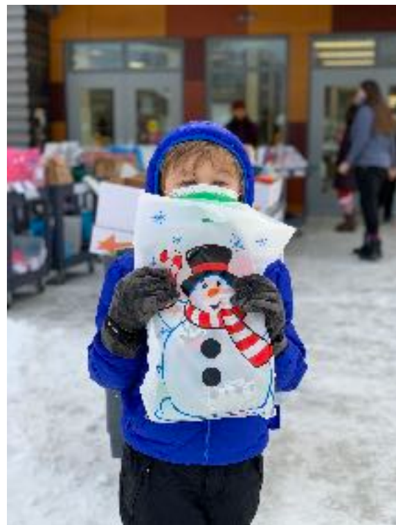
Student holds his gift bag from Father Frost - Yippee!

Father Frost & Snow Maiden "visited" K-6 immersion students this year via Turnagain's morning announcements. Small gift bags were distributed by MIR Parents volunteers as a special holiday treat.