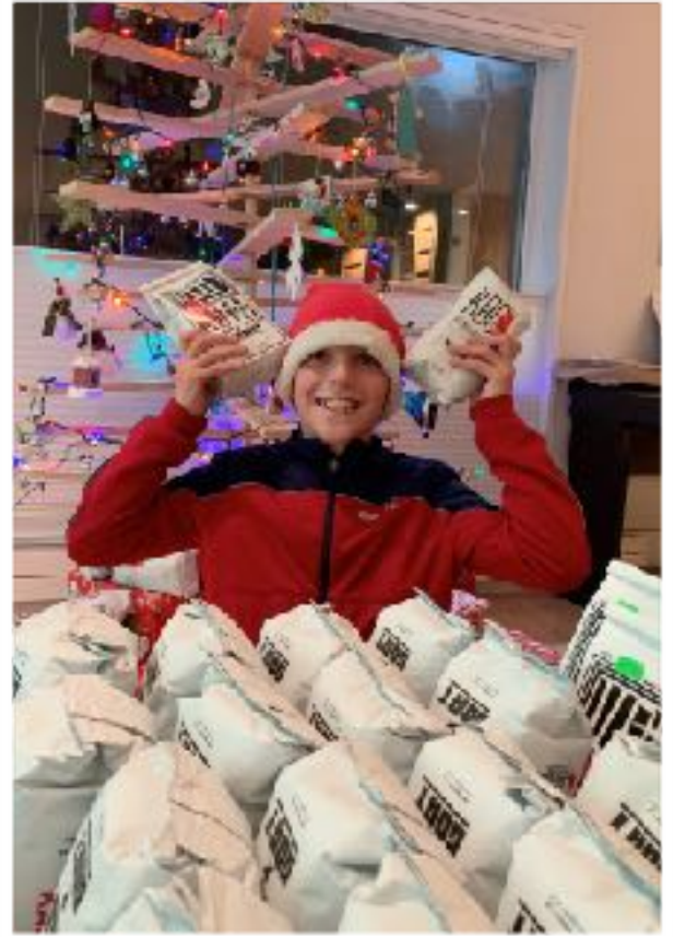
The Dudley boys were the 2020 coffee “elves.” Thanks, guys!