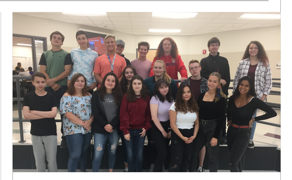
2020 Russian Immersion Graduates of West High School

Facebook @AnchorageMIR, russianimmersionak@gmail.com, and at mirparents.org